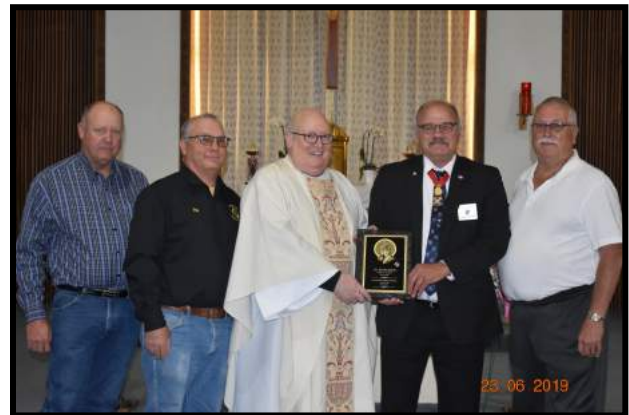
Our co-Priests of the year for 2018-2019.