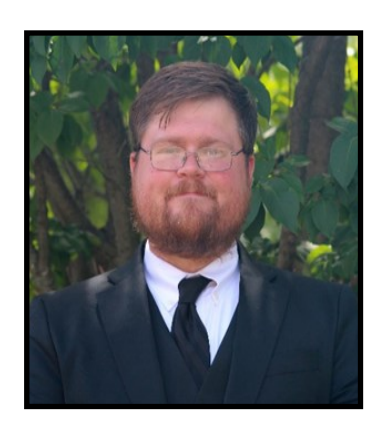
Pre-Theology I University of Saint Mary of the Lake