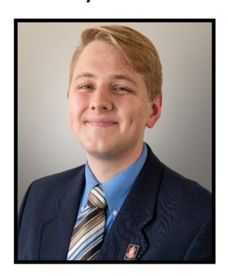
Theology I University of Saint Mary of the Lake