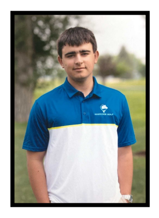
Propaedeutic Year Immaculate Heart of Mary Seminary

700 Terrace Heights, Box #808 Winona, MN 55987