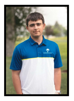
Propaedeutic Year Immaculate Heart of Mary Seminary

700 Terrace Heights, Box #808 Winona, MN 55987