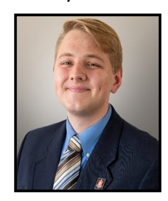
Theology I University of Saint Mary of the Lake