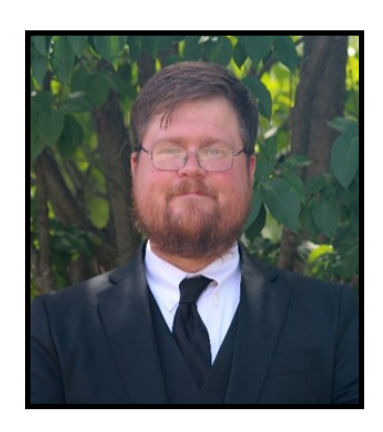
Pre-Theology I University of Saint Mary of the Lake