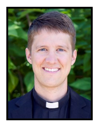
Theology III University of Saint Mary of the Lake