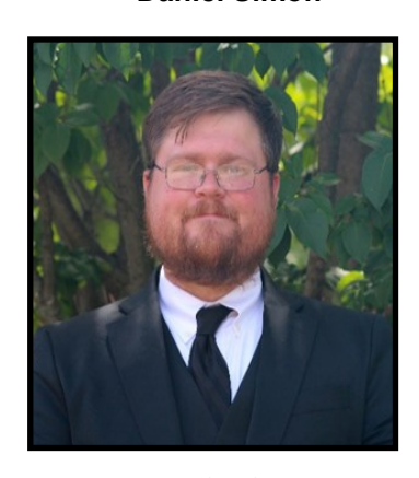
Pre-Theology I University of Saint Mary of the Lake