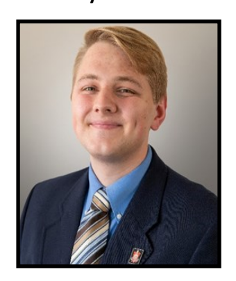
Theology I University of Saint Mary of the Lake