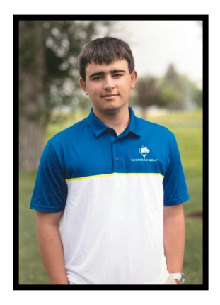
Propaedeutic Year Immaculate Heart of Mary Seminary

700 Terrace Heights, Box #808 Winona, MN 55987