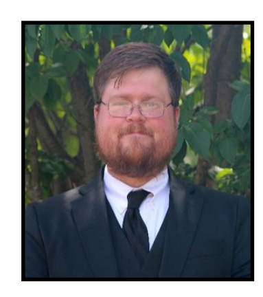
Pre-Theology I University of Saint Mary of the Lake