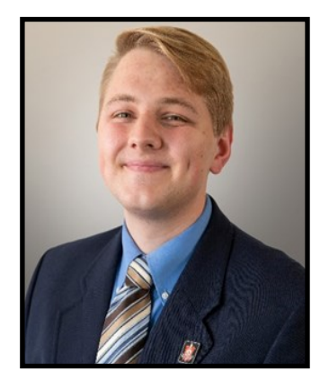
Theology I University of Saint Mary of the Lake