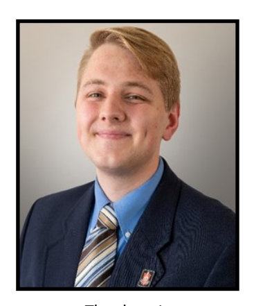
Theology I University of Saint Mary of the Lake