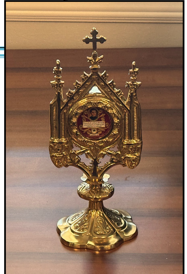
First Class Relic of Blessed Father McGivney that toured the State of Wyoming in March 2025